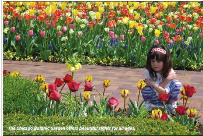
The Chicago Botanic Garden offers beautiful sights for all ages.